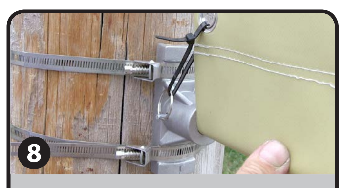
Slide the banner over the poles and use the zip ties through the retainer rings and grommets to secure the banner in place. Adjust the bottom bracket to ensure that the banner is taut.