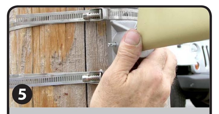
Insert the clevis pins through the open hole. Note: A mallet or hammer may be necessary to tap the pins through each of the holes.