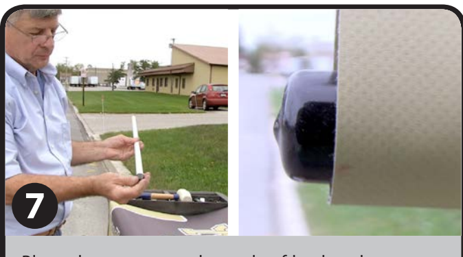
Place the caps onto the ends of both poles.