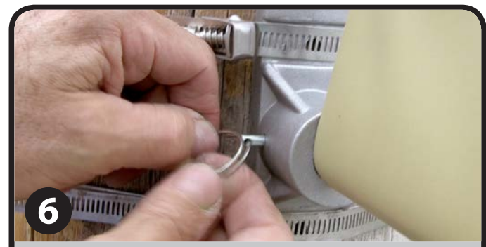
Thread the retainer rings through the hole in the end of each of the clevis pins.